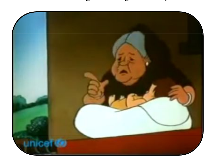
Verbs: chide, instruct,