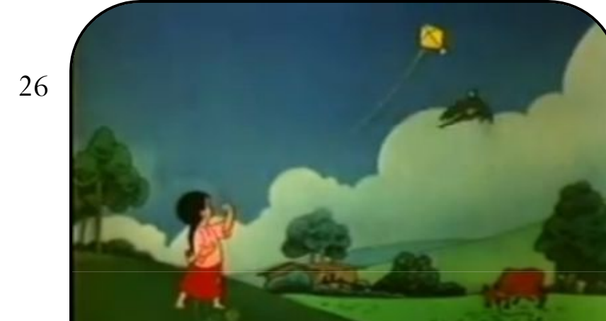
Verbs: play a kite, graze, fly