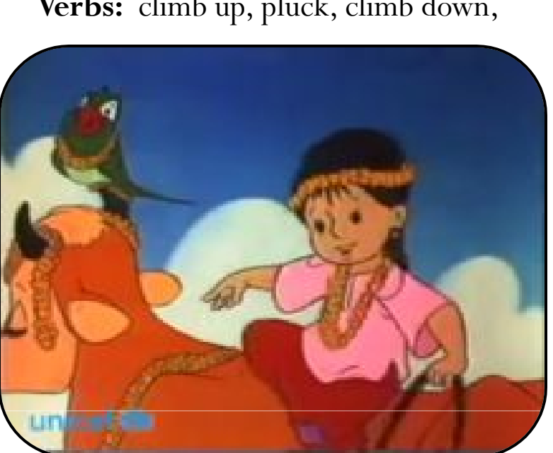
Verbs: climb up, pluck, climb down,