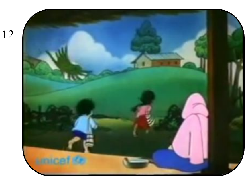
Verbs: carry, run, bid bye