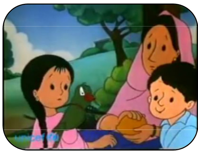
Verbs: enquire, explain, wonder