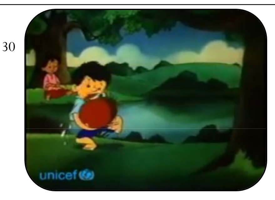
Verbs: climb up, pluck, climb down,