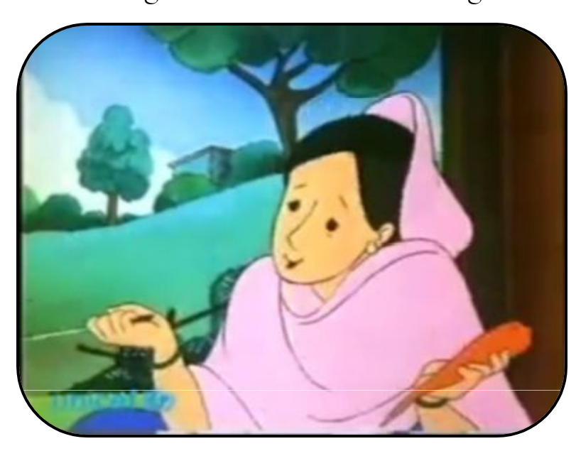
Verbs: explain, talk, ignore