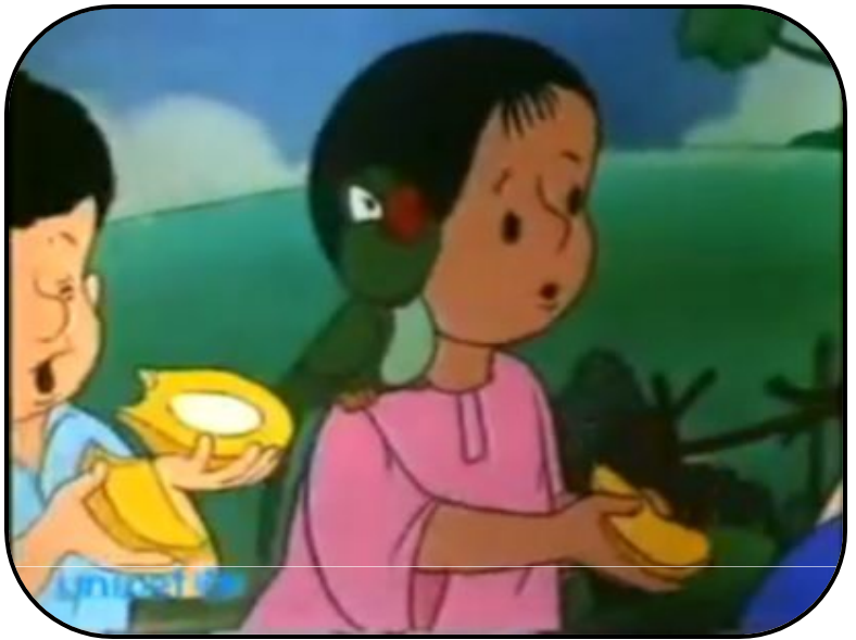
Verbs: complain, eat, relish, bite