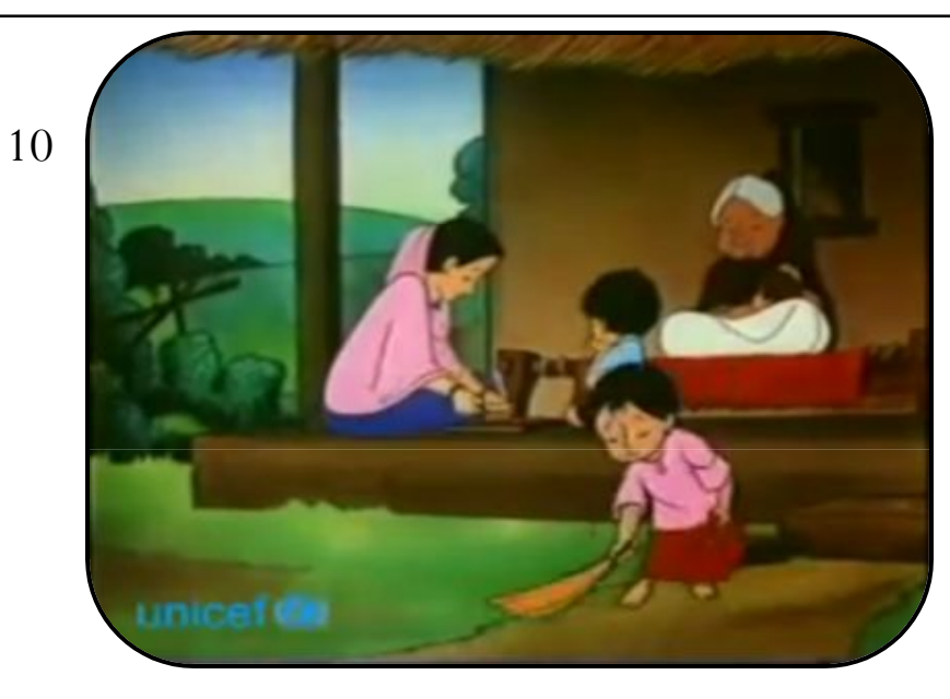
Verbs: chop, sweep, study