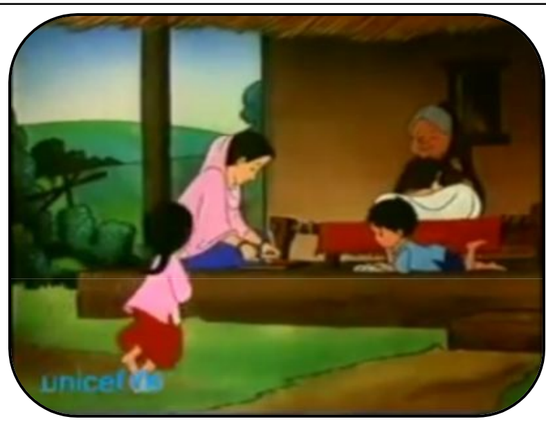
Verbs: return, go, take, give, study,