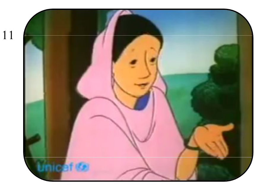
Verbs: instruct, send